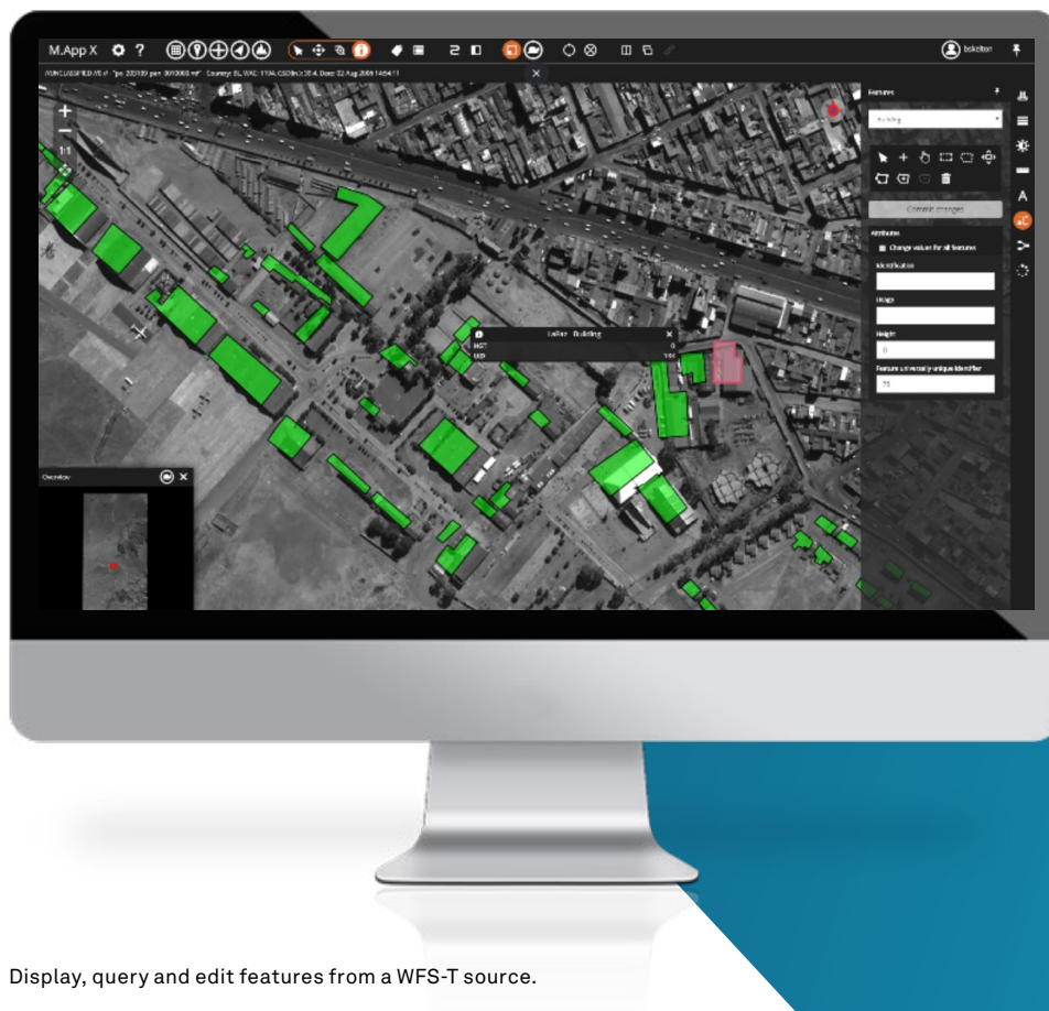
Display, query and edit features from a WFS-T source.

Make your maps and reports more illustrative and interpretable using a rich styling library of symbols, lines, brushes, polygons and text to identify features. Annotation positions are reported and stored in the map space to facilitate overlay on other imagery.