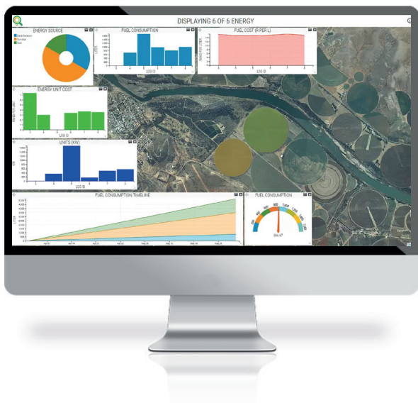
Interactive dissemination of personal spatial data