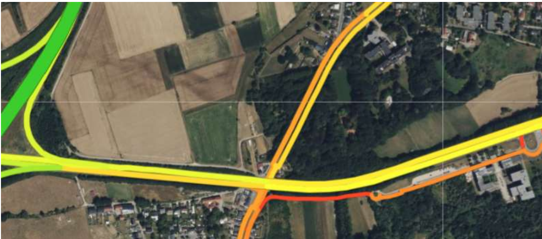
Figure 2: Example of Azure Maps traffic and aerial imagery in LuciadRIA

LuciadRIA 2025.0 introduces support for Azure Maps. Bing Maps is being deprecated by Microsoft , which offers Azure Maps as its new mapping service. We will continue to support Bing Maps for Bing Maps for Enterprise services users, for which Microsoft will continue support until June 30, 2028.