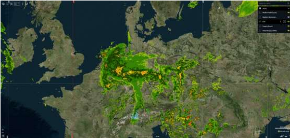
Figure 3: Example of Azure Maps weather data in LuciadRIA

Sample code/documentation to get you started