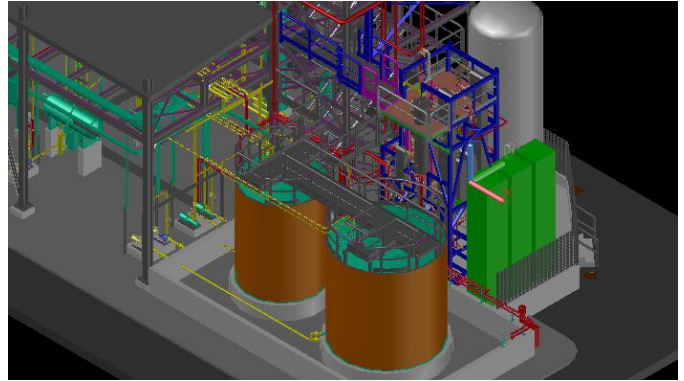
A 3D model created of the cryogenic plant created in CADWorx Plant Professional.