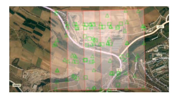
Produce accurate data using triangulation.